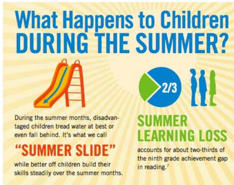
Graphic courtesy of: National Summer Learning Association

and each theme includes skill reinforcement activities. Using the same assessment tool at the end of the summer we can evaluate the success of this newly updated program. 🌱